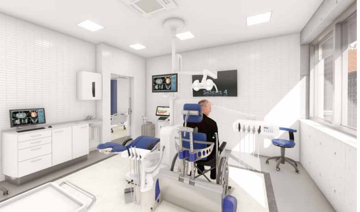
| Specially lit treatment rooms provide for a more relaxed atmosphere.

situation. This involved specialists from different sections of the NYU coming together. Parents of disabled children were also included. Several blueprints were created which were discussed exhaustively. Such big meetings needed to be moderated and steered to a decision. The impressive result is now of benefit to the patients. And as a practical side effect participants were able to network more closely inside the university. "Our task was always to keep our target in the crosshairs," says Marlin. "In the many meetings, we found that ultimately the same patients are always involved. Treating them holistically then also seemed meaningful and effective to everyone."