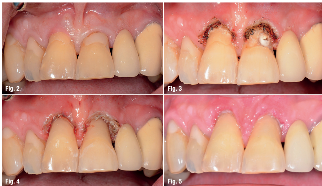
Fig. 2: Pre-operative situs.