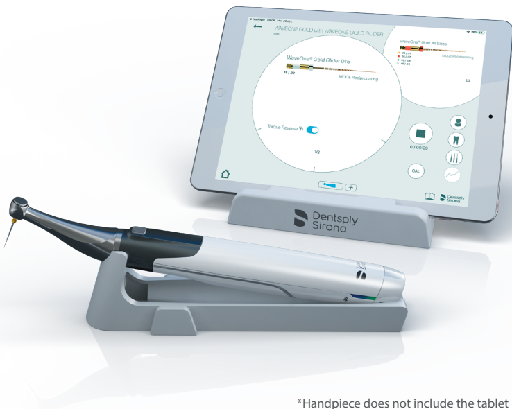
*Handpiece does not include the tablet